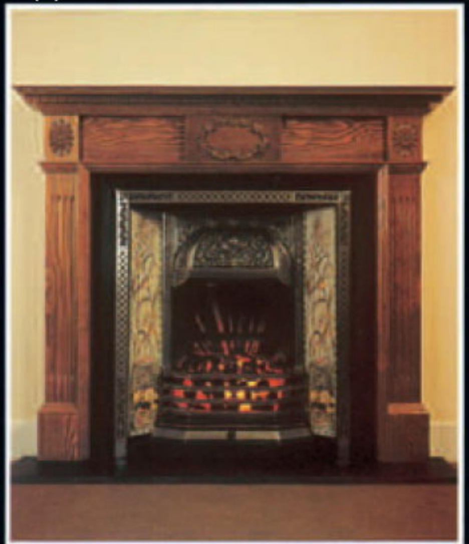
Model 208 Victorian

Coalec made from a template. Example of a custom made 'Coalec fuel and flame effect' fire incorporating fan heater; also available without heat, Model 204.