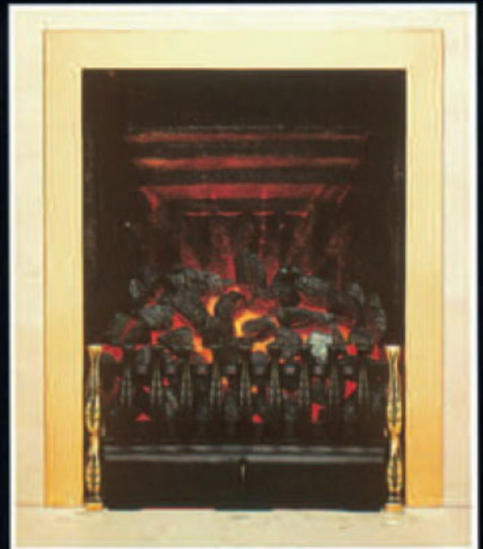
Model 206 Coalec With a fan heater. Suitable for a tapered fireback, and for use with a standard or flat fire front.